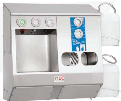
INLET Complete type 23771 without turnstile