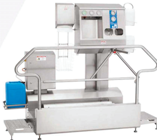
Star Clean IV type 23882 with Inlet Complete type 23761