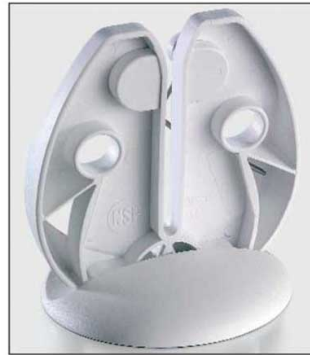
Hygienic, ultrasonically-sealed spring housing