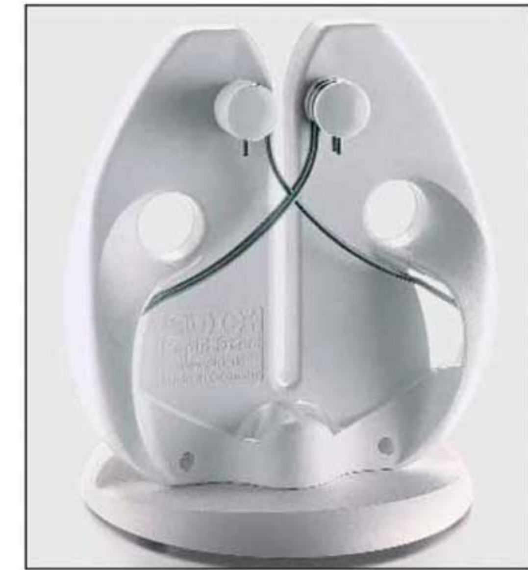
Accessory: Stand Prod. No. 9008106-05