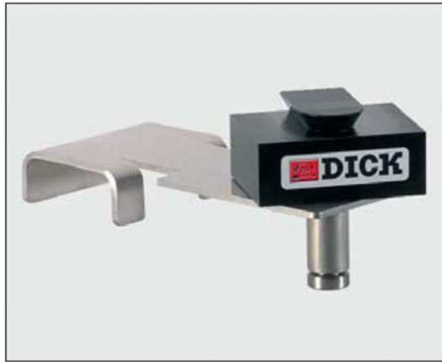
Accessory: Holder for fastening at the work place Prod. No. 9008102