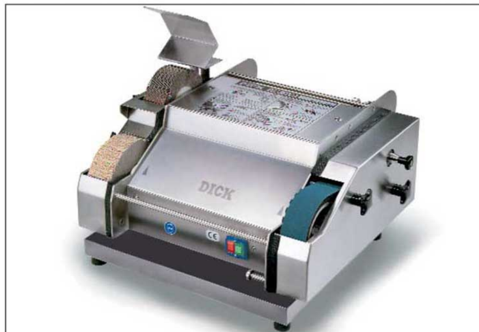
Universal Grinding Machine DICK SM-160 T