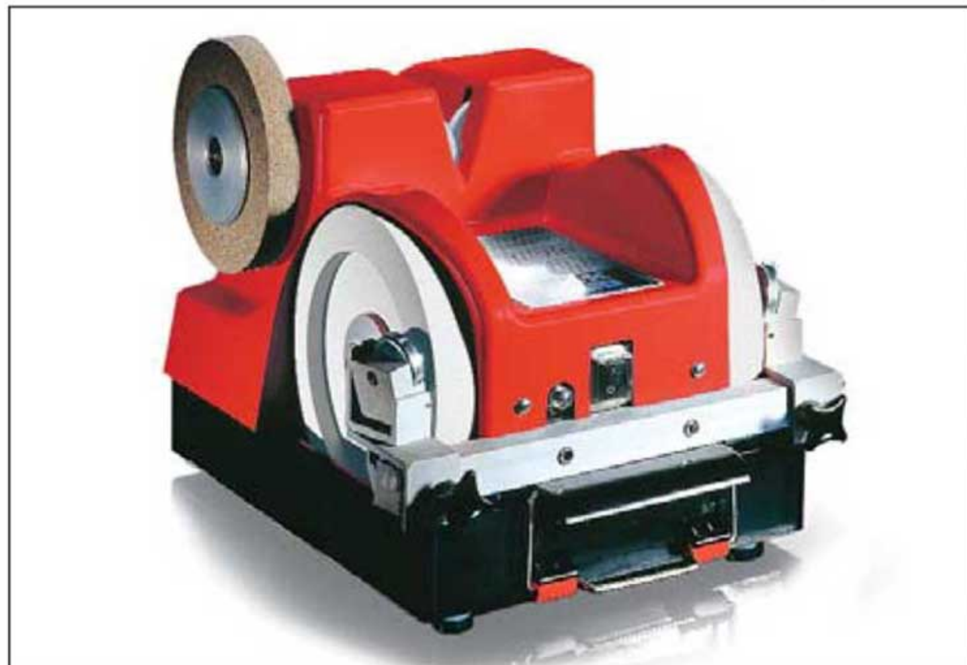
Grinding-, Honing- and Polishing Machine DICK SM-111

As leading knife manufacturer DICK is certainly competent regarding the sharpening of all types of knives. There are many different requirements for how a knife blade can be ground. DICK offers individual solutions e. g. for butchers and the meat processing industry.