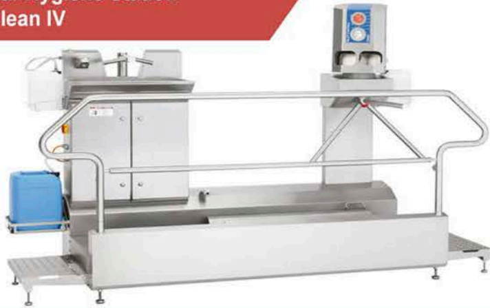
STAR CLEAN IV Type 23881 All in One