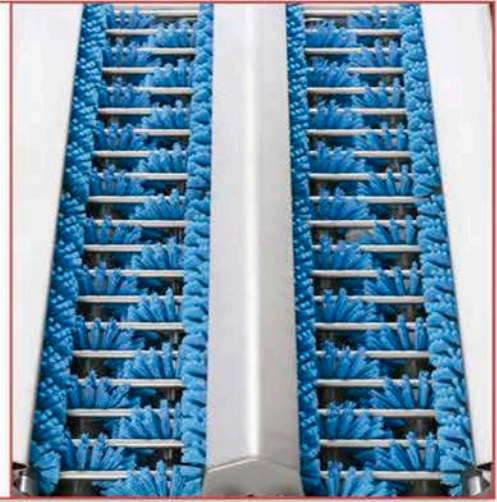
Special bristles (sole side cleaning optional)