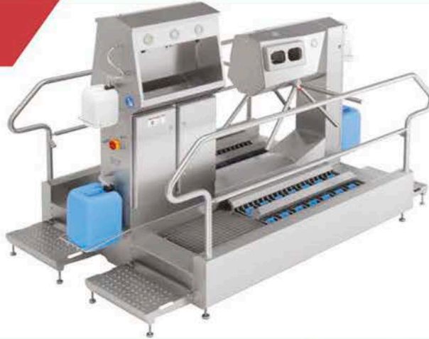
Star Clean IV All in One Compact type 23893-1600