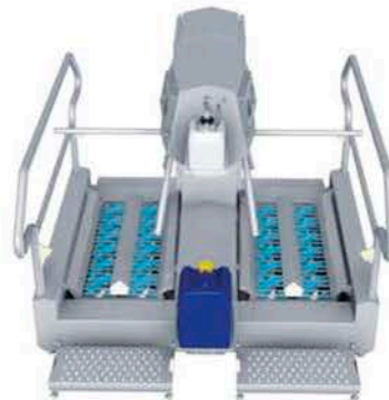
Star Clean IV Compact type 23892-1000