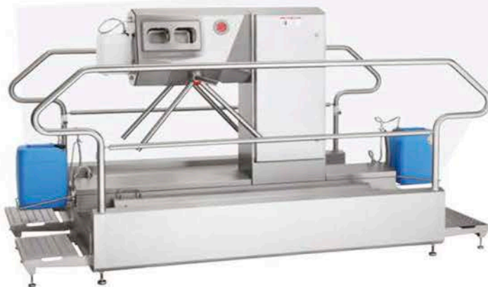
Star Clean IV Compact type 23891-1600