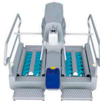
Star Clean IV Compact type 23892-1000