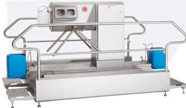
Star Clean IV Compact type 23891-1600