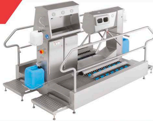
Star Clean IV All in One Compact type 23893-1600