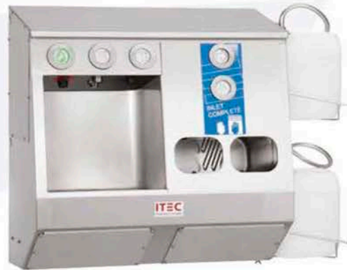
INLET Complete type 23771 without turnstile