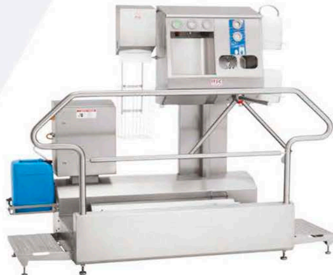
Star Clean IV type 23882 with Inlet Complete type 23761