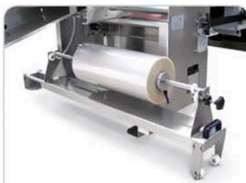
Reel holder designed for easy loading