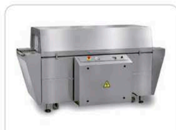
Openable top cover shrink tunnels