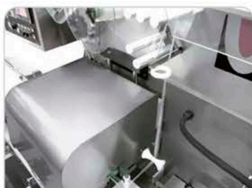
Shrink film version