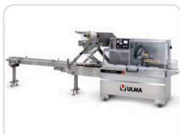
Top reel version