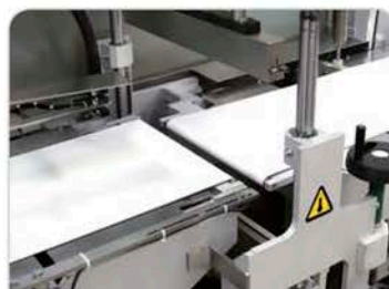
Sealing heading designed to avoid dirt accumulation