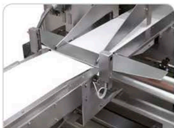
Belt type in-feed conveyor