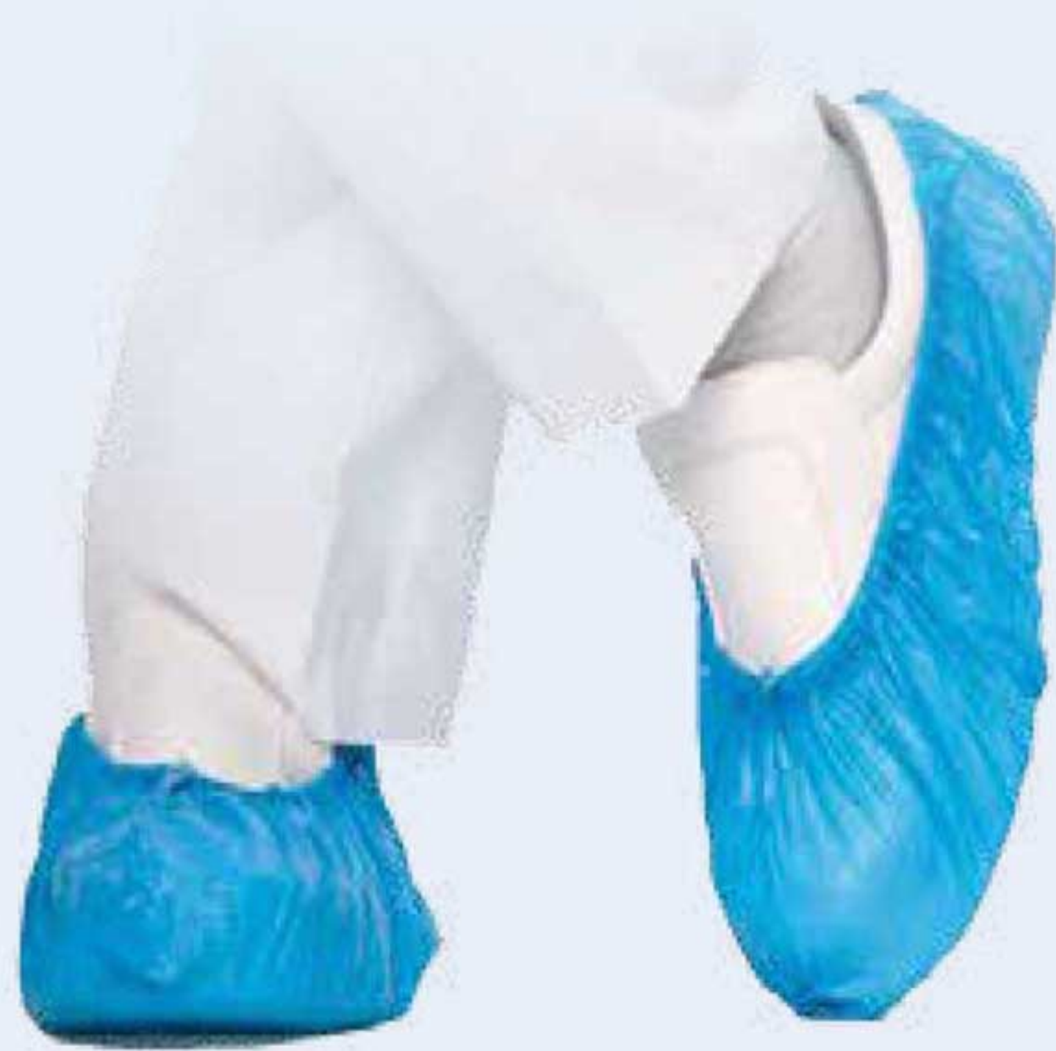
Overshoe CPE for HYGOMAT