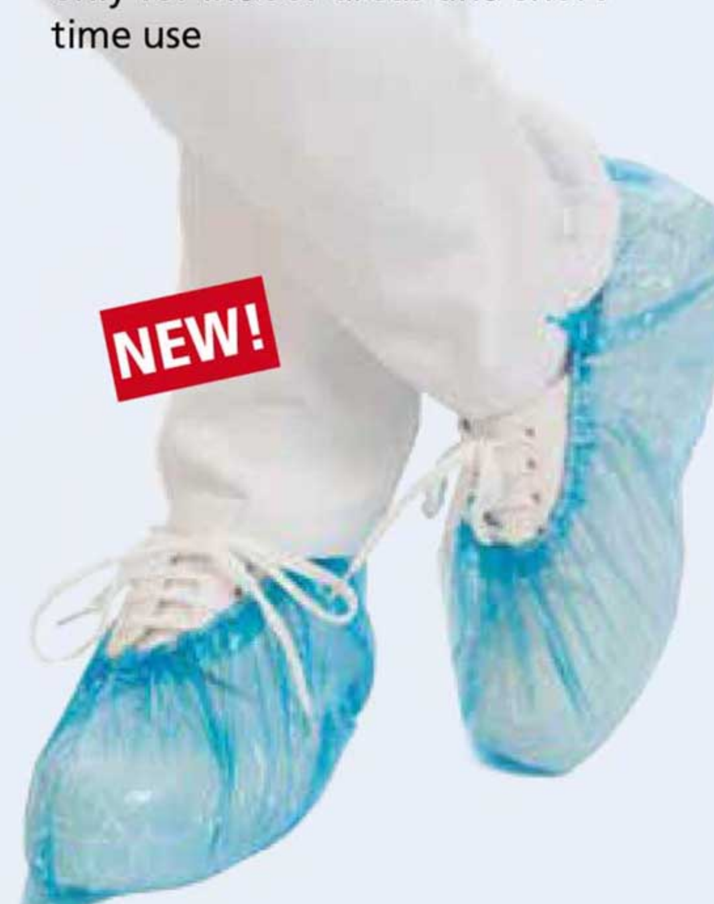
Overshoe ECONOMY for HYGOMAT