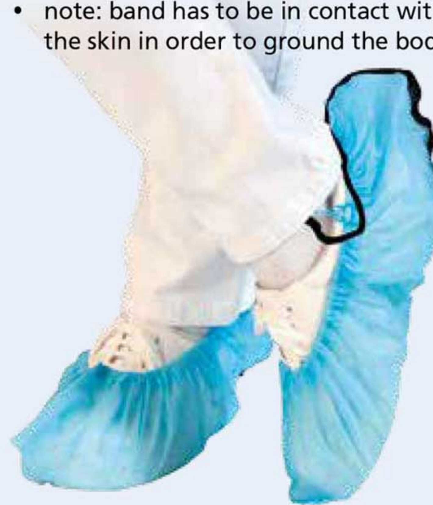
PP overshoe with antistatic band for HYGOMAT