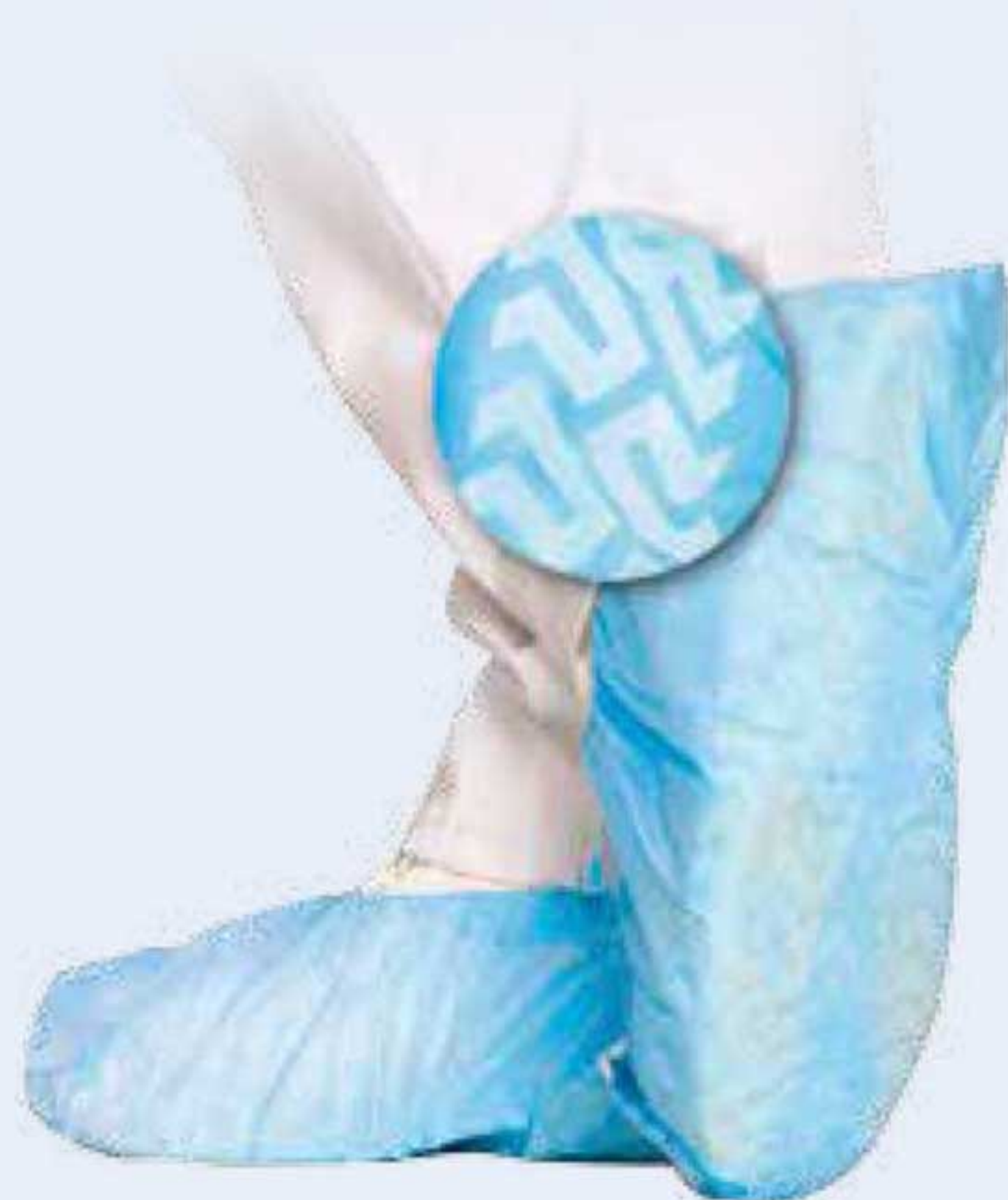
PP overshoe with structured sole for HYGOMAT