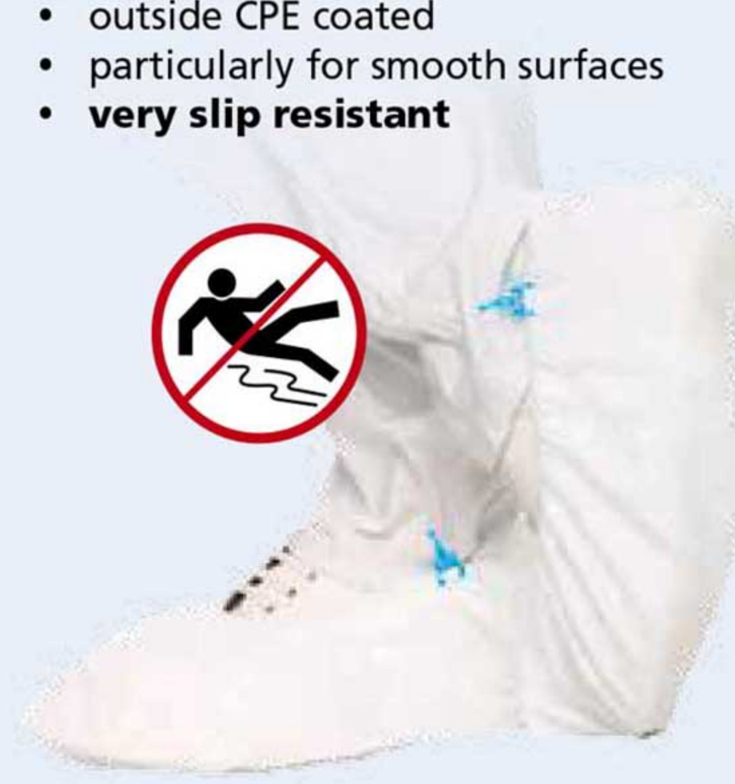
Nonwoven overshoe with CPE coating for HYGOMAT