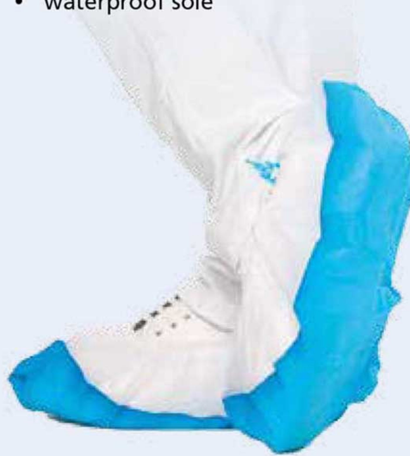
Overshoe with strong CPE sole for HYGOMAT